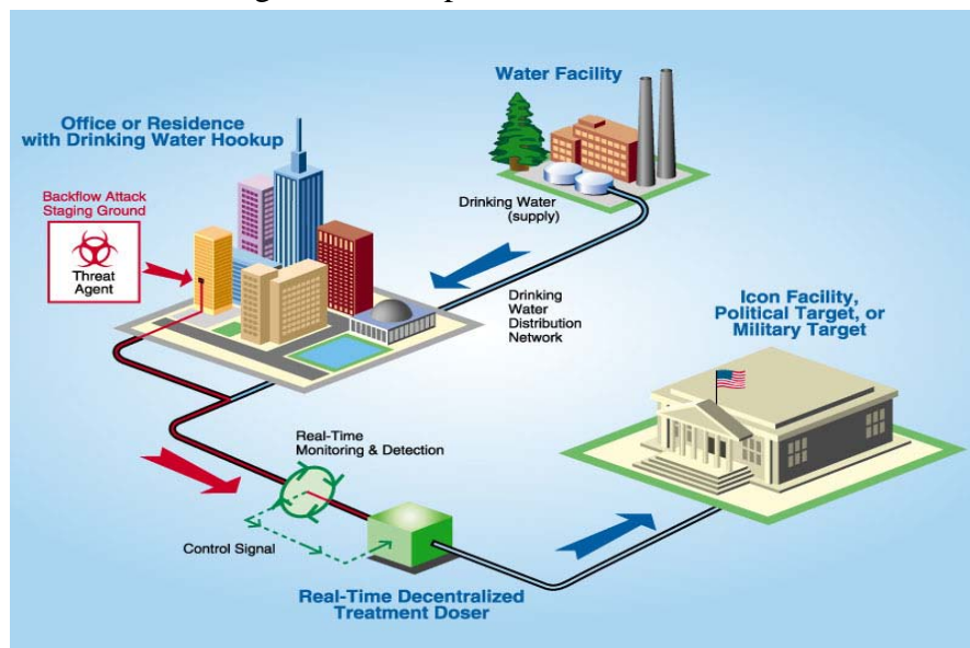
Figure 2. All distribution systems are vulnerable to backflow attacks.

A backflow attack occurs when a pump is used to overcome the pressure gradient that is present in the distribution system's pipes. This is usually around 80 lbs/in 2 and can be easily achieved by using pumps available for rent or purchase at most home improvement stores. After the pressure has been overcome and a contaminant introduced, Bernoulli effects pull the contaminant into the flowing system and the normal movement of water in the system acts to disseminate the contaminant throughout the network effecting areas surrounding the introduction point. The introduction point can be anywhere in the system such as a fire hydrant, commercial building or residence. See figure 2. Studies conducted by the US Air Force and Colorado State University have shown this to be a very effective means of contaminating a system. 53 A few gallons of highly toxic material was enough, if injected at a strategic location via continuous feed, to contaminate an entire system supplying a population of 150,000 people in a matter of a few hours. A terrorist could launch such an attack and be on a plane out of the country before the first casualties begin to show up.